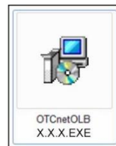
OLB zip file