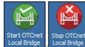
Start and Stop OLB icons