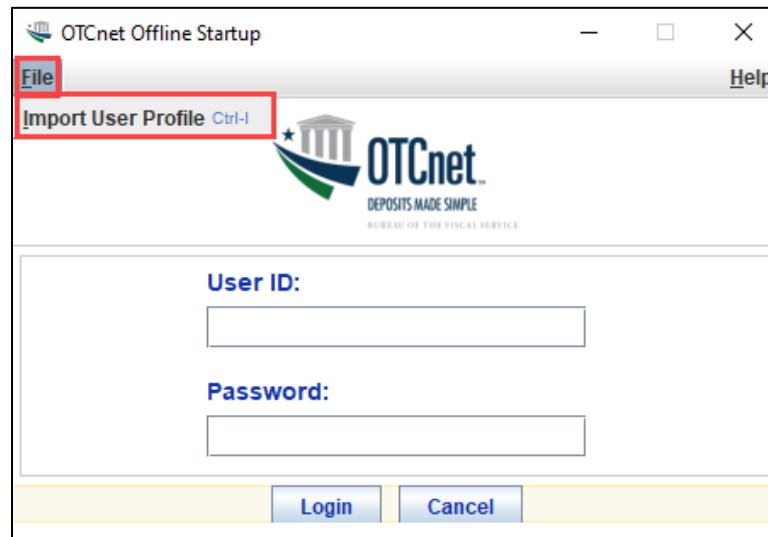
Figure 1. OTCnet Offline Startup