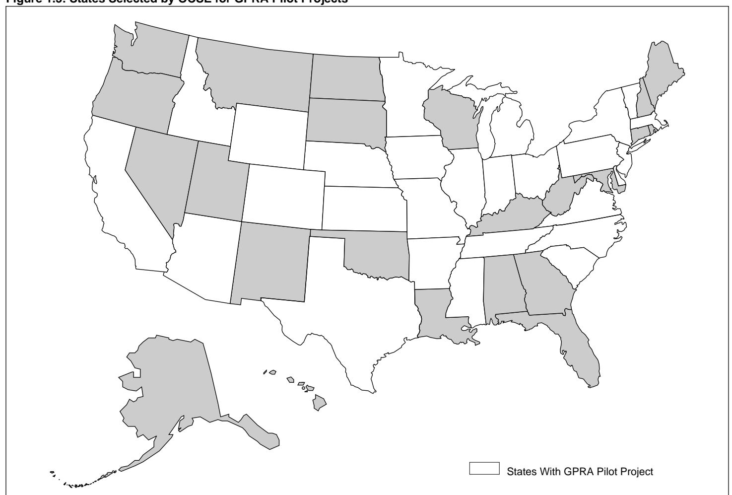
Figure 1.3: States Selected by OCSE for GPRA Pilot Projects

Note: OCSE also selected five other jurisdictions as pilot projects, including two counties, two cities, and Puerto Rico.